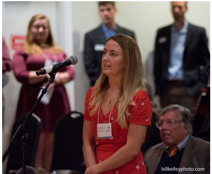
On Sept. 25, 2019, more than 200 people attended an IJC public hearing in Ashland, Wis. focused on water quality in Lake Superior.

The IJC was created in 1909 to help resolve transboundary water disputes all along the U.S./Canada border — from the St. Croix River in the east , to the Yukon River in the west . The IJC consists of three commissioners appointed by the federal government of the United States, three commissioners appointed by the federal government of Canada, as well as an extensive binational team of experts and support staff. During the first several decades of its history, the IJC focused primarily on water-quantity issues, but starting in the 1970s, it took a more proactive focus on water quality, particularly in the Great Lakes. The IJC's role is important, but advisory, leaving actual policymaking and regulatory action to the U.S. and Canadian federal governments.