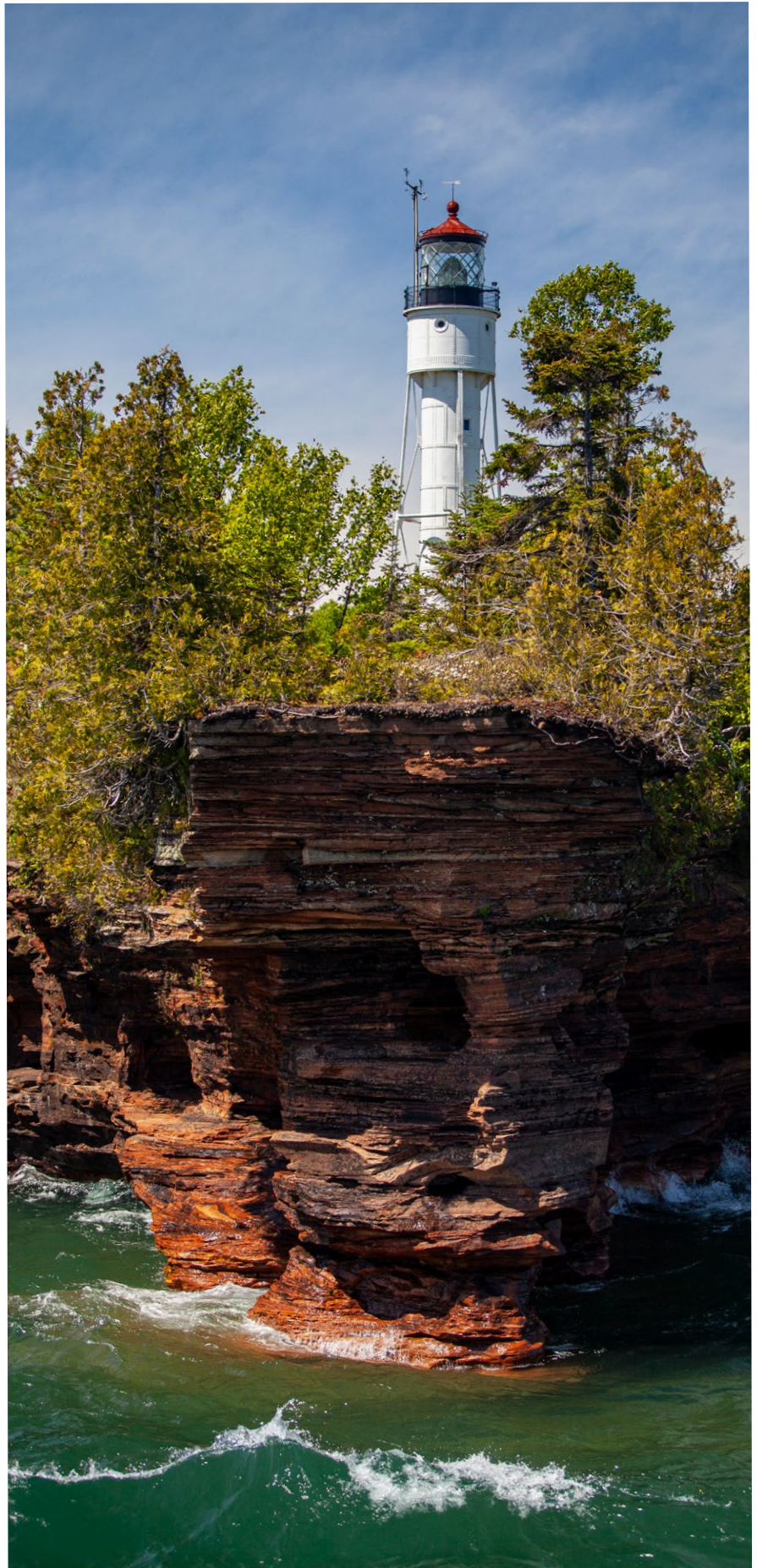
The Apostle Islands National Lakeshore is one of the most popular tourist destinations on the south shore of Lake Superior.

In other words, tweaking may not be enough. Perhaps a thoroughly revised Water Quality Agreement could also reinvigorate the binational water quality relationship, bringing new attention and new vigor to the complex Great Lakes water quality challenges of the 21st century. But for the next generation of water quality stewards at Northland College — and throughout the watershed — the situation will require more than just vigor. It will require tangible binational action that leads to measurable and significant improvements to “the chemical, physical and biological integrity of the waters of the Great Lakes.”