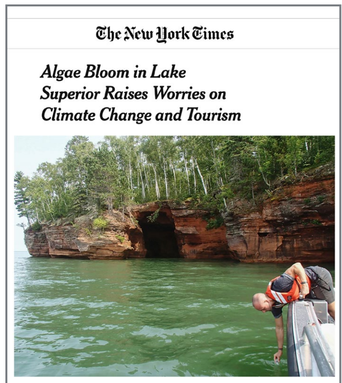
Algal blooms on Lake Superior in 2018 received national attention.