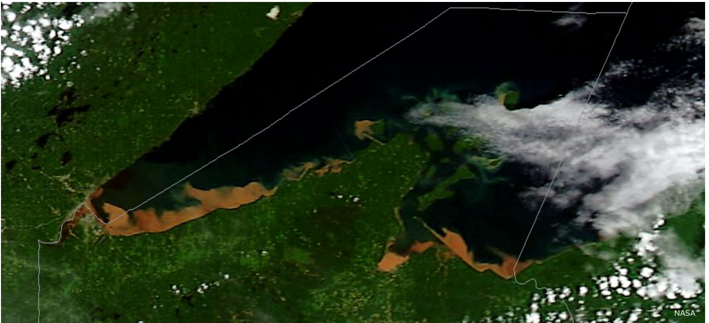
Three massive storms between 2012 and 2018 along the south shore of Lake Superior created sediment plumes so large that they were visible from space.

The National Oceanic and Atmospheric Administration (NOAA) says the Ashland region is a notable “hotspot” of rainfall patterns far outside historical norms. Estimates put the losses of public infrastructure from the three recent, massive storm events in the range of $150 million, but the future cost will be much greater. NOAA estimates that intense rainfall amounts in the Ashland area are 37 percent higher than the mid-20th-century assumptions used by engineers and transportation planners to build much of the region’s transportation infrastructure, like bridges and culverts. What’s more, these new precipitation estimates don’t even factor in the large, intense storms since 2012. Still harder to gauge: long-term, reputational damage from these storms and their secondary effects on a regional tourism industry founded on Lake Superior’s pristine image as the cleanest of the Great Lakes.