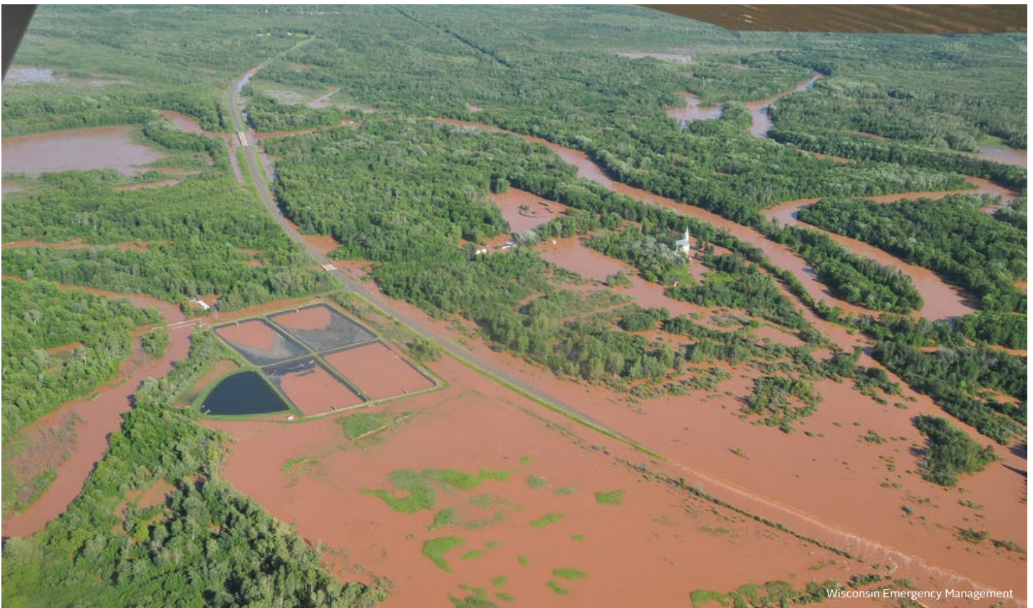
A "1,000-year-storm event" in 2016 inundated U.S. Highway 2 and the Bad River Indian Reservation east of Ashland, Wis.

What Might They Tell Us About the Future of the Great Lakes Water Quality Agreement?