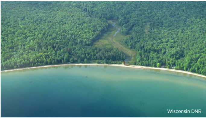
Frog Bay Tribal National Park on the Red Cliff Indian Reservation near Bayfield, Wis.

shoreline includes the shallow and productive waters of Chequamegon Bay , the Apostle Islands National Lakeshore , the Frog Bay Tribal National Park on the Red Cliff Indian Reservation and the Bad River/Kakagon Slough , which is a globally recognized Ramsar Wetland of International Importance located on the Bad River Indian Reservation.