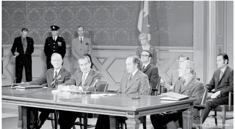
President Richard Nixon and Prime Minister Pierre Trudeau at the signing ceremony for the Great Lakes Water Quality Agreement in 1972.