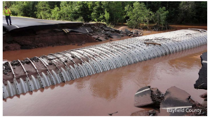
Raging runoff from a 1,000-year storm in 2016 blew out numerous federal, state and county highways near Ashland, Wis.