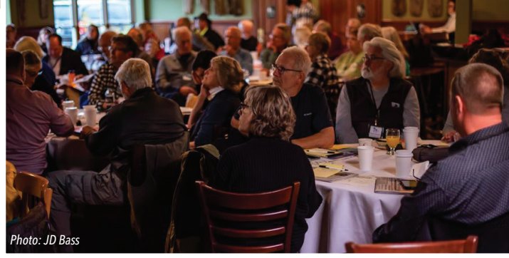
During the 2018 Great Lakes Island Summit attendees met to finalize the GLIA Charter and appoint a steering committee.